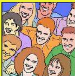
Regular Meeting September 15th Zone Meeting