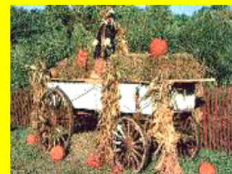
Ned Mosier Apple Butter Festival - October 16th