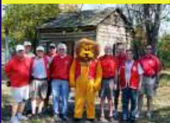
Ned Mosier Apple Butter Festival - October 16th