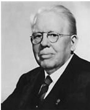
Melvin Jones Lions Clubs Founder

Within three years, Lions became an international organization. Since then, we've earned high marks for both integrity and transparency. We're a well-run organization with a steady vision, a clear mission, and a long – and proud – history.