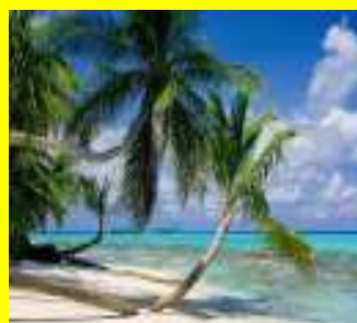
October 20th Meeting Visiting the South Pacific