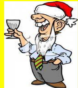
December 15th Meeting Christmas Party