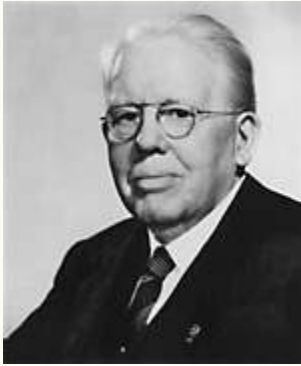
Melvin Jones Lions Clubs Founder

Within three years, Lions became an international organization. Since then, we've earned high marks for both integrity and transparency. We're a well-run organization with a steady vision, a clear mission, and a long – and proud – history.